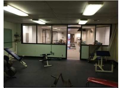
The new weight room area in the old tech and metals classrooms.

The weight room is now located in the main building in the industrial arts area (metals classroom and tech lab). This move will not affect any of the shop class offerings and is a better situation for our kids. This change will be good for our students and will be more of a source of pride for our school than the old weight room.